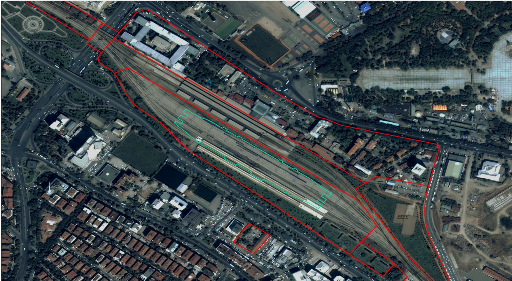
HIZLI TREN BINASI