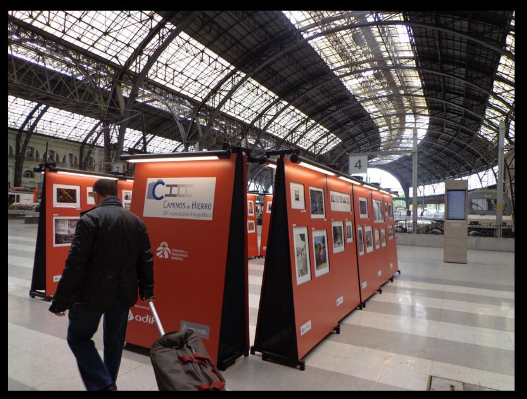
Caminos de Hierro 2013 - Barcelona Estació de França