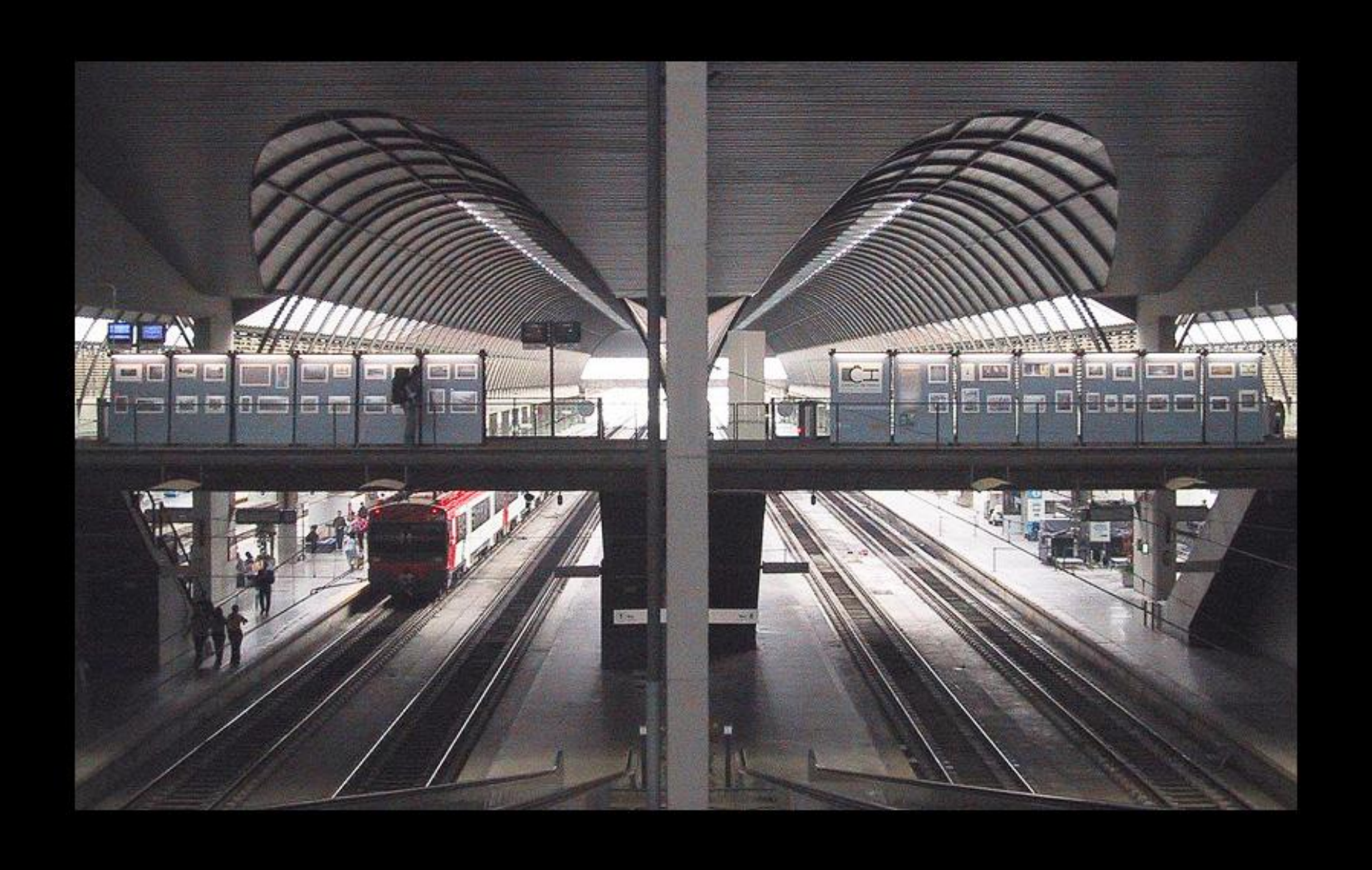
Caminos de Hierro 2004 - Sevilla Santa Justa