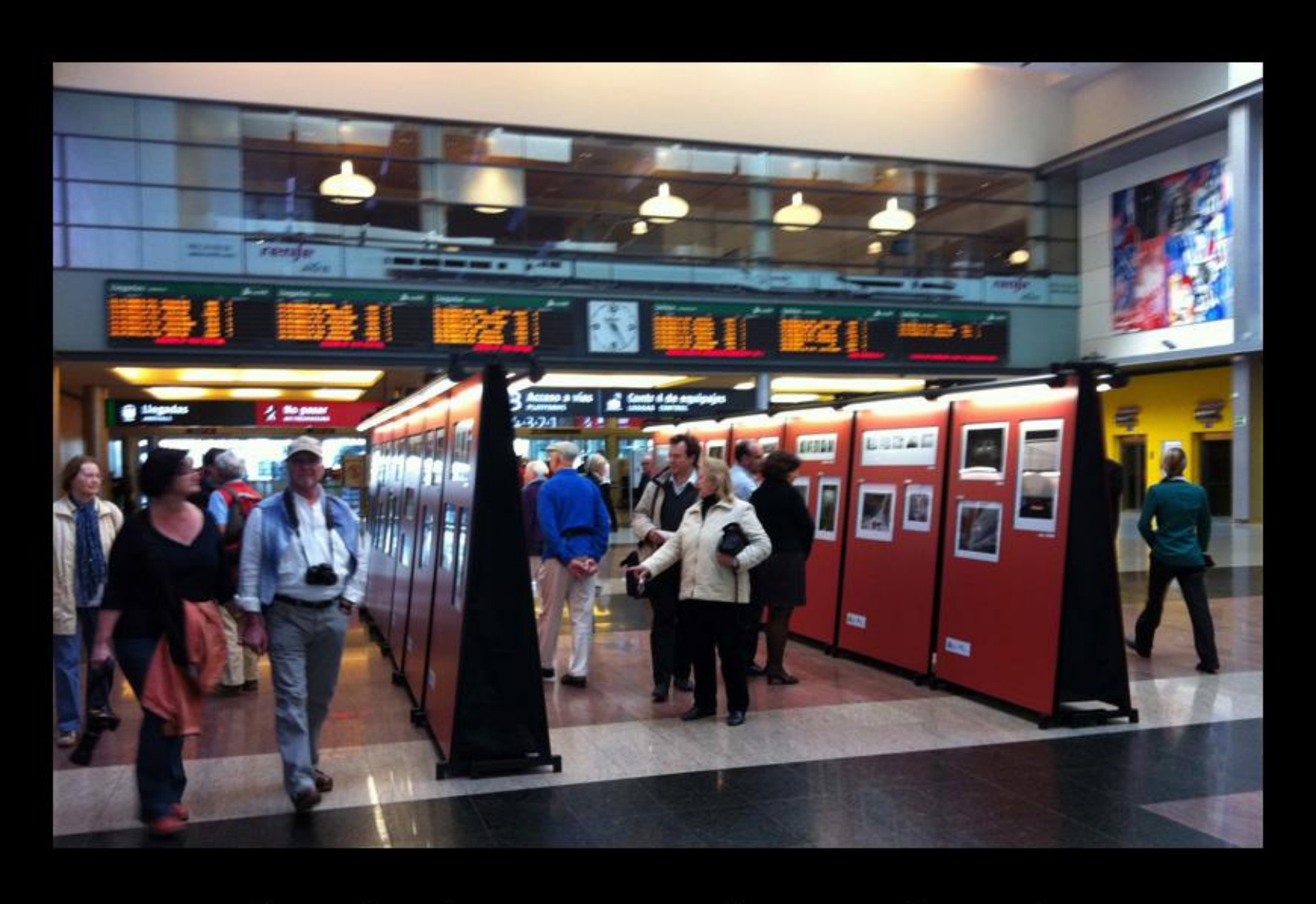
Caminos de Hierro 2012- Málaga María Zambrano