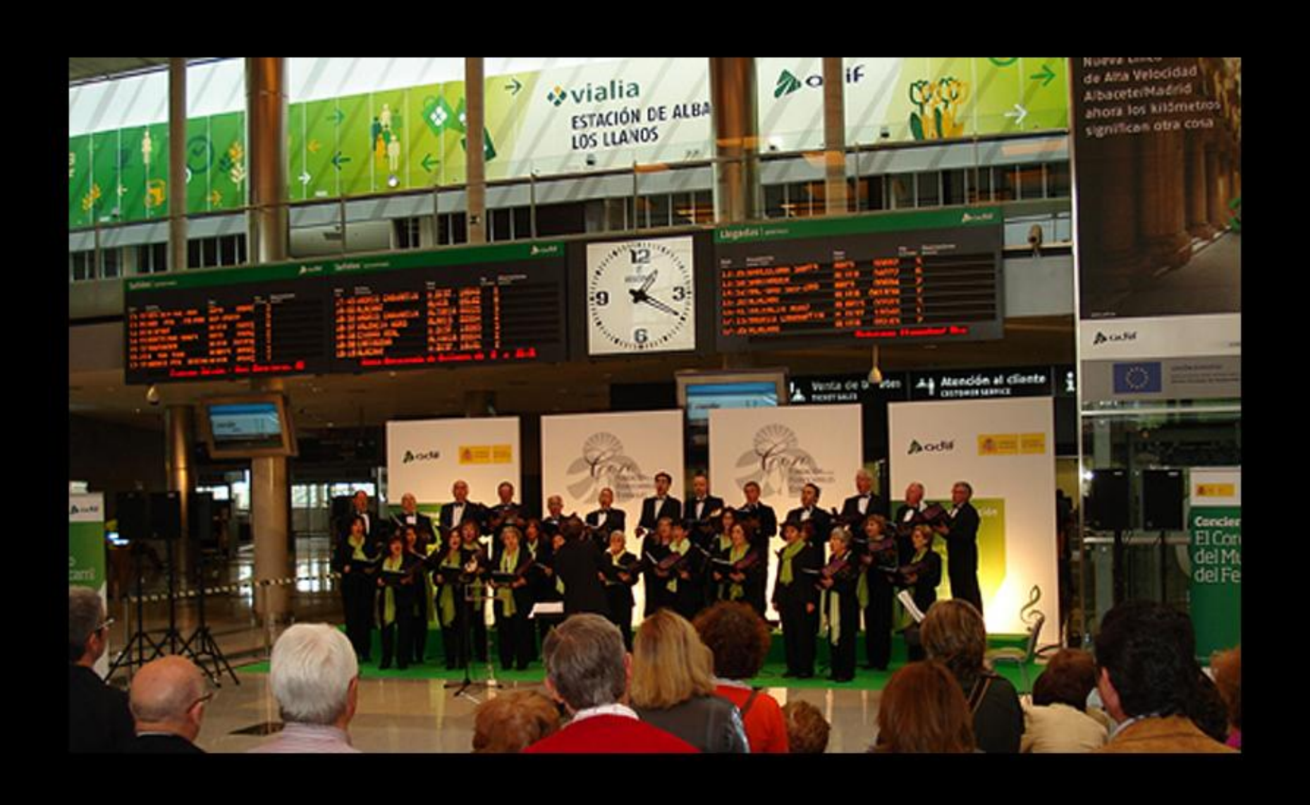
Chorus Concert - Albacete Los Llanos 2011