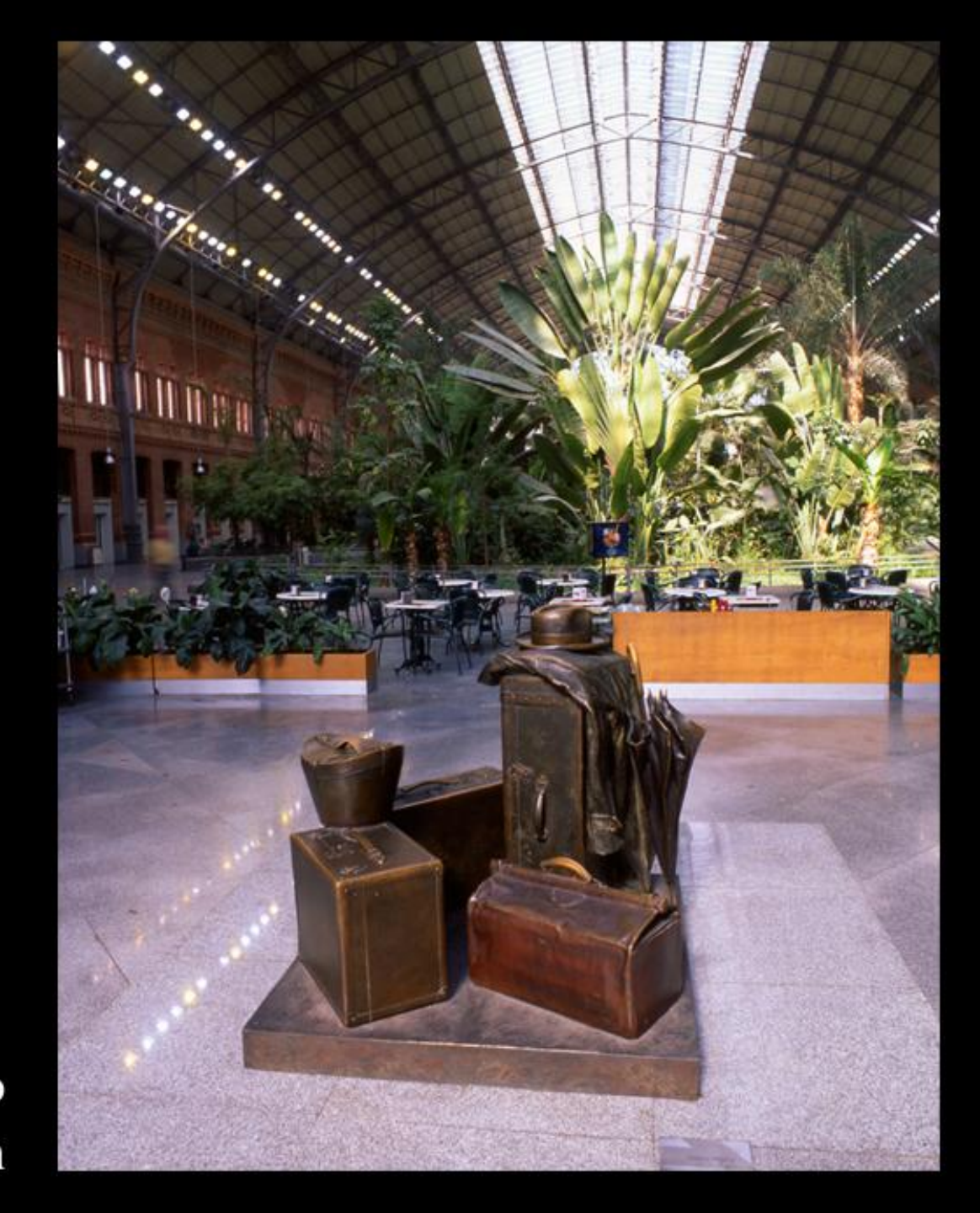
Úrculo Madrid Puerta de Atocha