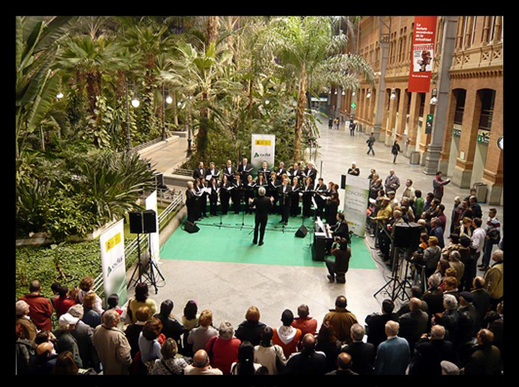
Chorus Concert - Madrid Puerta Atocha 2008