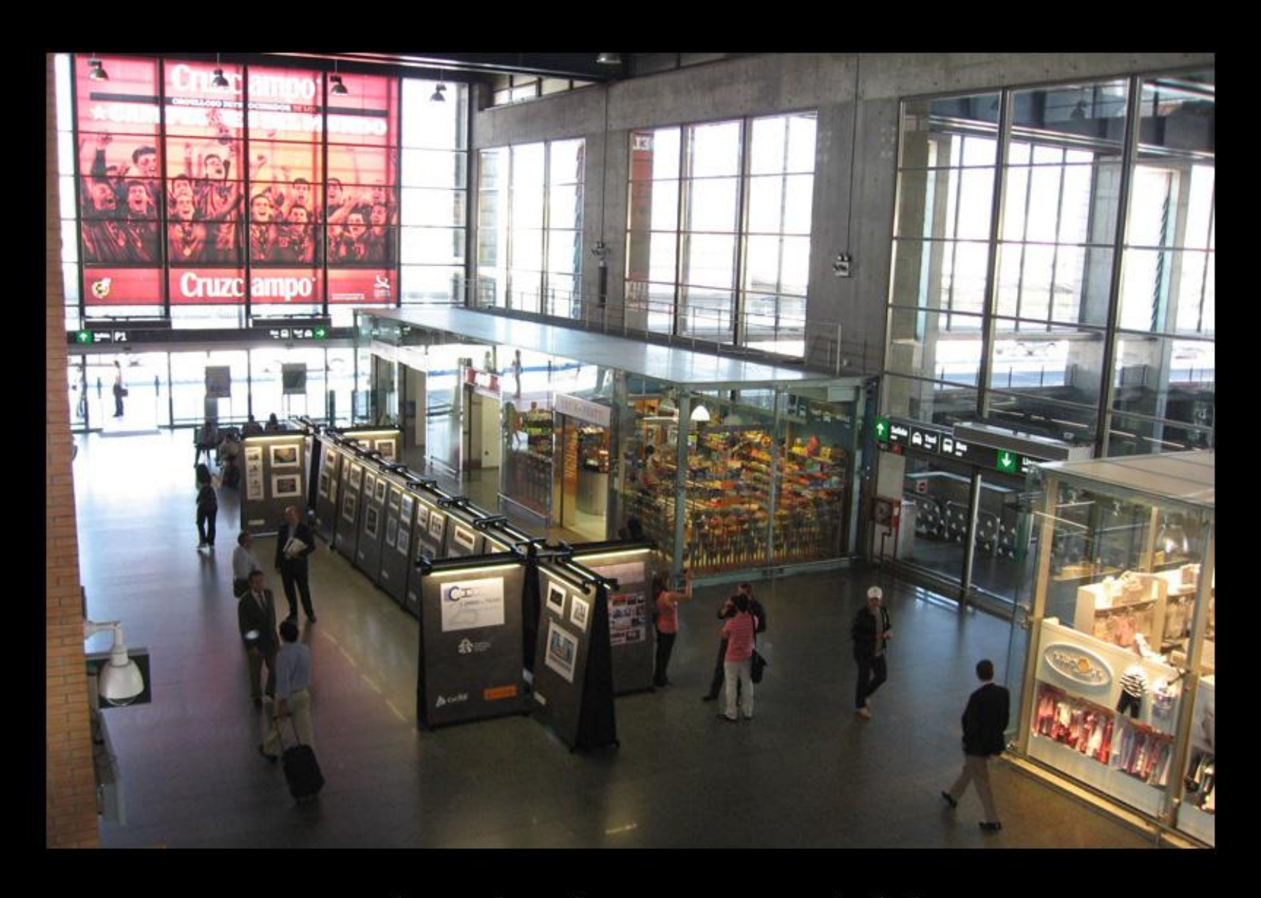
Caminos de Hierro 2011- Córdoba