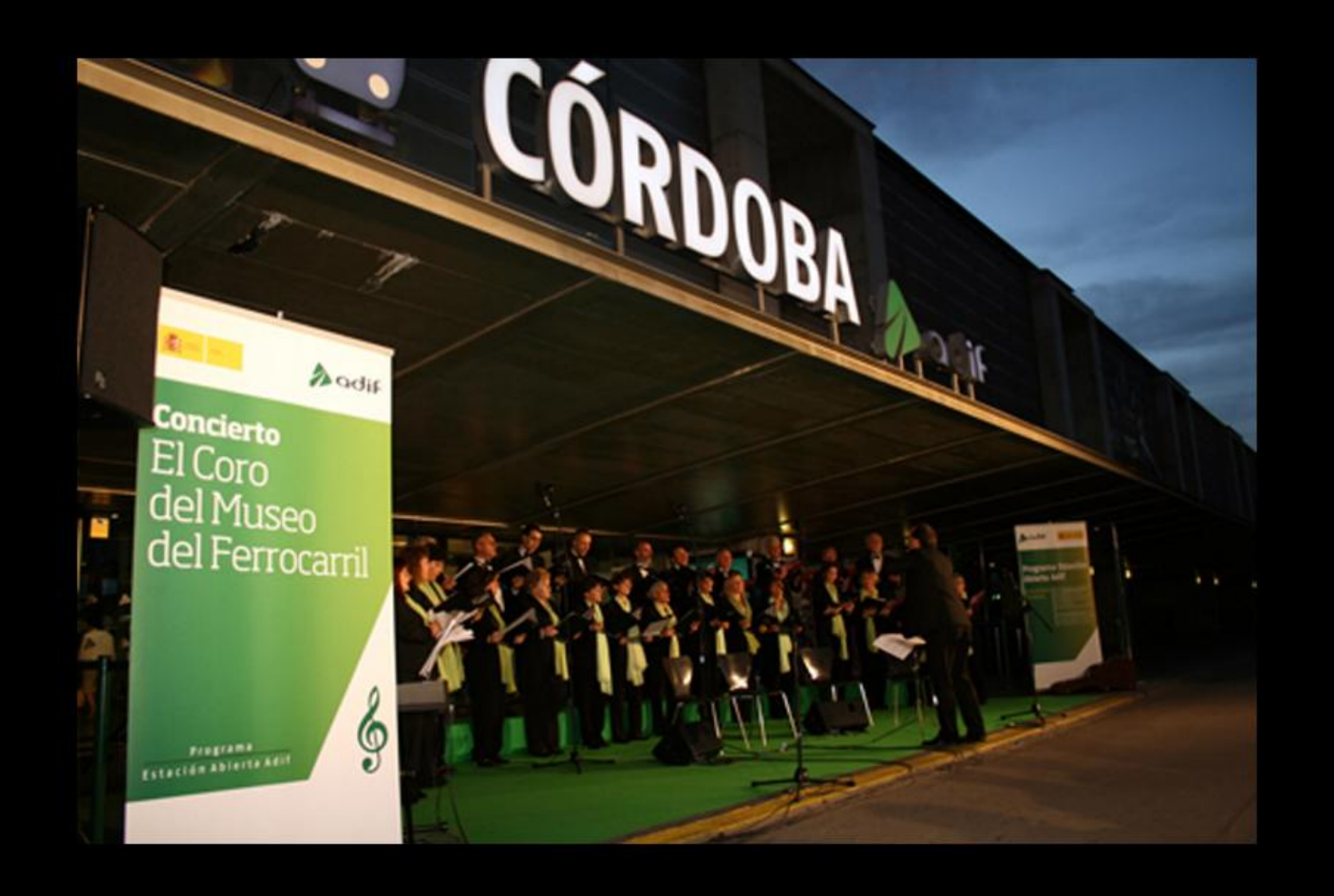
Chorus Concert - Córdoba 2010