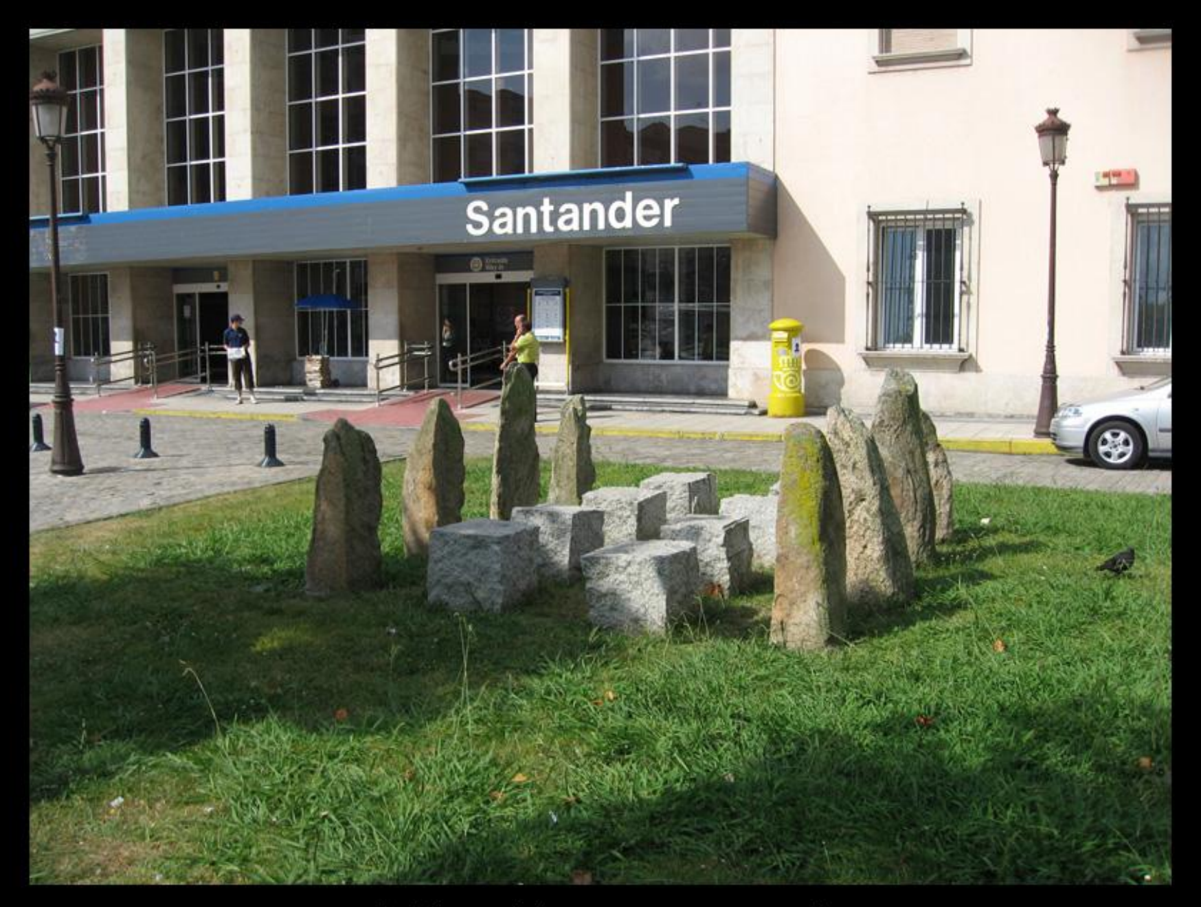
Adolfo Schlosser - Santander