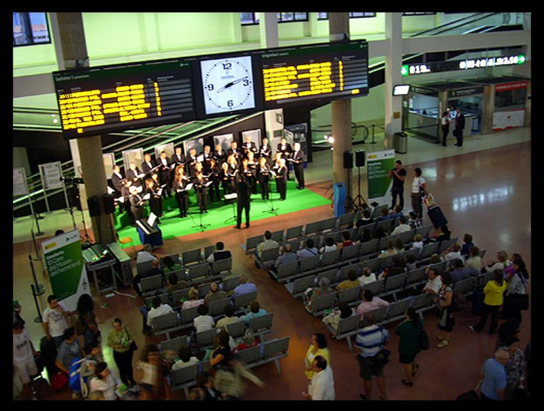
Chorus Concert - Ciudad Real Central 2009