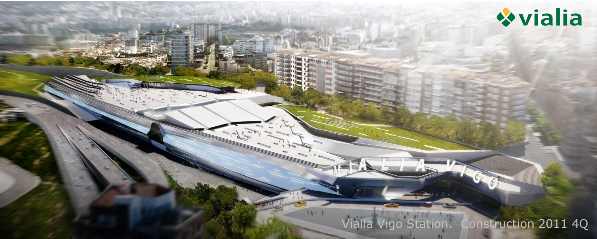
Vialia Vigo Station. Construction 2011 4Q