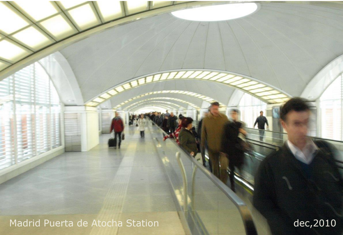
Madrid Puerta de Atocha Station