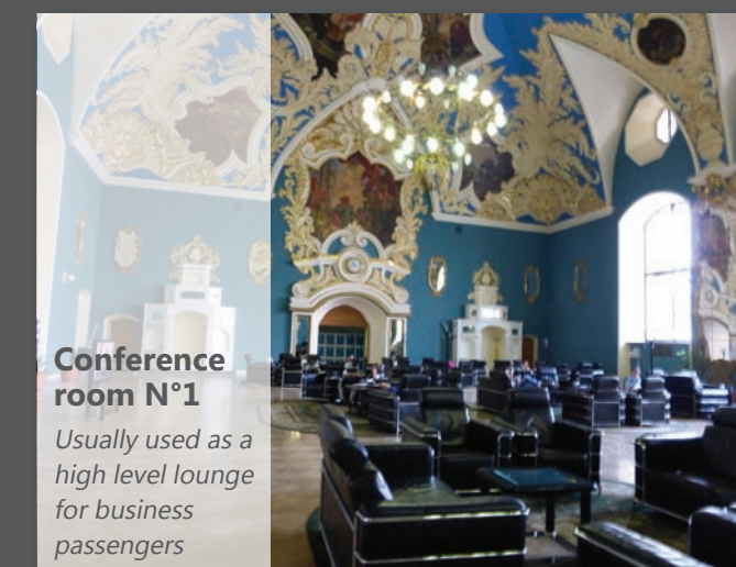
Conference room N°1

Usually used as a high level lounge for business passengers